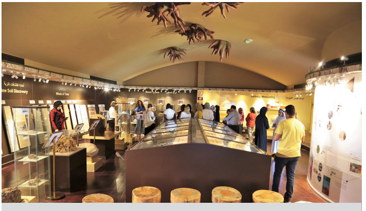
The museum regularly welcomes visitors from the UAE and other countries.