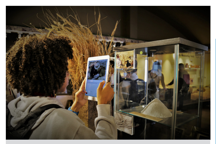
Students, researchers and other visitors benefit from resources available at the museum

Moreover, it runs special workshops and other activities where participants learn about topics such as soil formation, soil and water analysis, composting and regenerative agriculture, urban farming, controlled environment agriculture, and sustainable production and consumption through hands-on experiences.