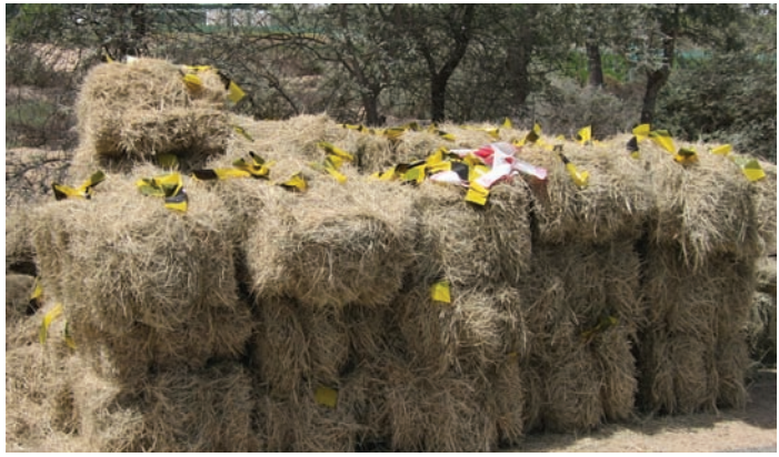
High fodder production of salt-tolerant grasses

Both grass species maintained a sustainable production over years over all treatments tested. Results indicated a consistent trend of increased production over increased salinity level. Research findings for forage production during 2009 revealed Sporobolus virginicus and Distichlis spicata showed a significant dependence of dry matter production over the season, with the yield being highest in summer harvests.