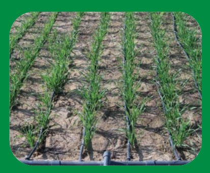
Integrated Water Resource System