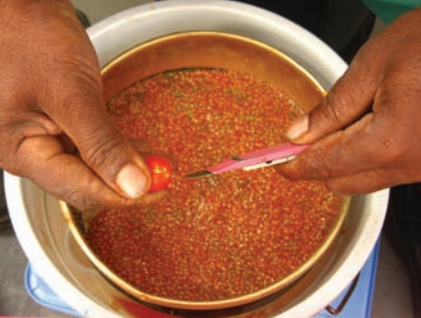
Tomatoes - variation in fruit characteristics (top) and Seed extraction (bottom)