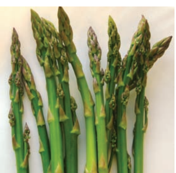
Asparagus spears have high nutritional value

Continued access to germplasm adapted to marginal environments for research and other uses requires that adequate seed stocks are maintained. Most often, the seed samples obtained from the donors or those collected from natural habitats will be in small quantities, therefore necessitating regeneration. Regeneration also becomes necessary when seed viability of individual accessions declines below acceptable limits or the seed quantities fall to low levels due to distribution to users. Furthermore, several of the economically important native plants are poor and unreliable seed producers and availability of propagation material of these species in quantities sufficient for large-scale use often becomes a limitation. Therefore, development of suitable seed production and plant propagation techniques is an important requisite to support any extension and developmental activities.