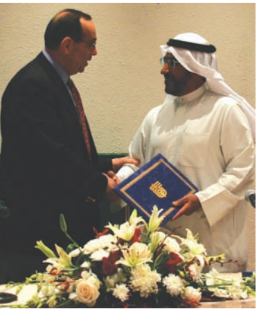
ICBA and KISR Director Generals after signing the MoU

established during the 10th General Assembly Meeting of the Standing