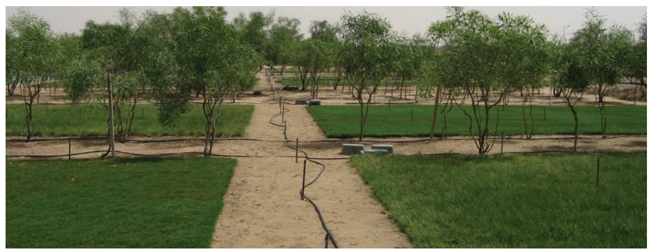
Integrating trees and shrubs in the Agroforestry system

There were no significant differences between the biomass for fertilized and non-fertilized treatments at all the salinity levels for both the grasses.