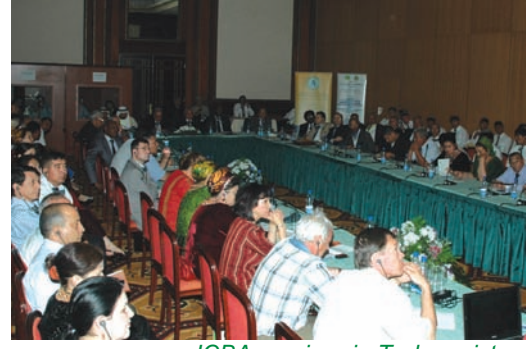
ICBA seminar in Turkmenistan