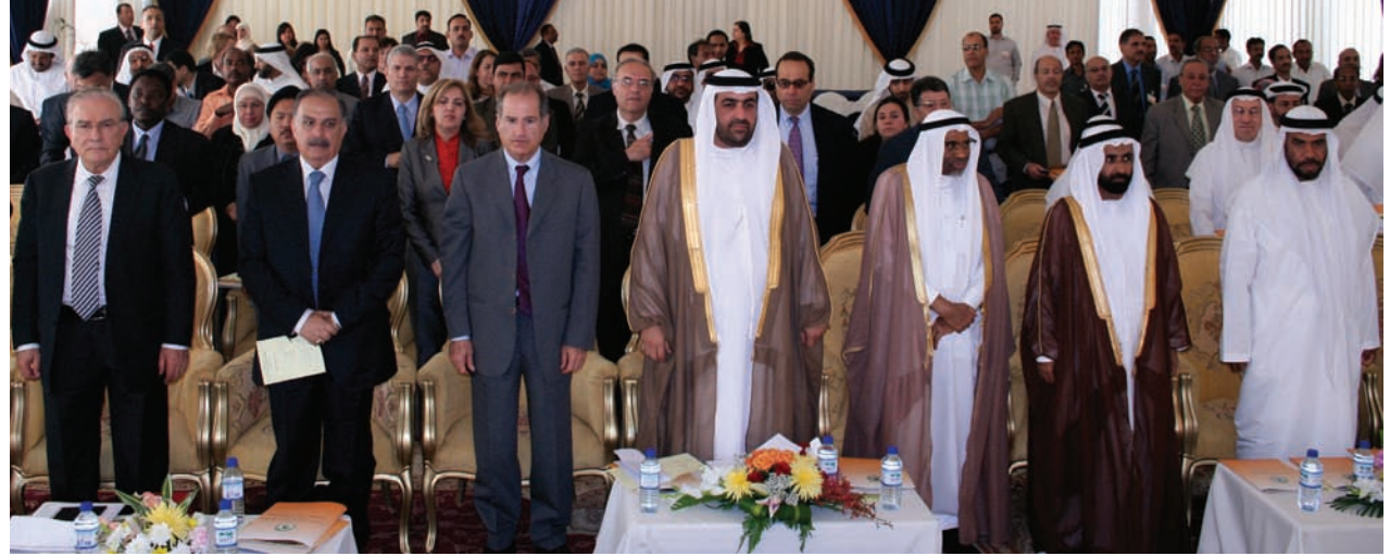
Dignitaries at the 10-year anniversary celebration

The celebrations comprised an opening ceremony, a series of scientific seminars and a tour of the research station. It is always gratifying on such occasions to acknowledge those who have contributed to