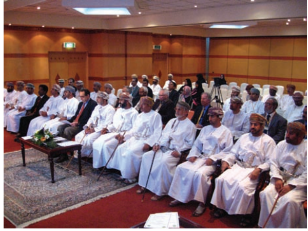
Participants in first workshop to develop Oman National Salinity Strategy

Consequently the Omani Ministry of Agriculture and the International Center for Biosaline Agriculture