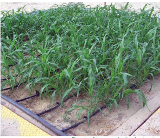
Pearl millet crop in the lysimeter

ICBA researchers are using these facilities to ensure the integrity of their comprehensive research program into crop water use of different crops/forages and development of crop coefficient values. In 2009 pearl millet is the crop being researched as part of this program.