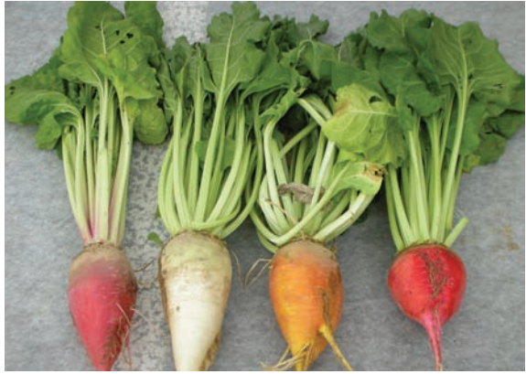
Variation in tuber color of fodder beet genotypes

In 2009, 62 barley genotypes including 4 check varieties were evaluated under field conditions at 5, 10 and 15 dS m<sup>-1</sup> of salinity levels. Observations so far indicate the presence of wide genetic variability among the germplasm for all growth parameters. Data on vegetative growth stages have been collected while data collection on seed yield and related characteristics is in progress.