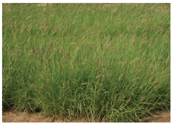
Cenchrus ciliaris growth under field conditions

ICBA has taken the lead in collecting local germplasm from different parts of the country. As part of its collaboration with the Ministry of Environment and Water (MOEW), it has initiated a collaborative work on two salt tolerant grasses, the indigenous cultivar of Lasiurus