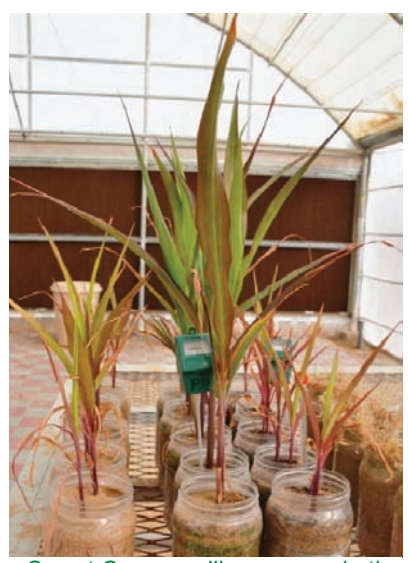
Sweet Corn seedlings grown in the greenhouse on control sand, Mixtures 1 and 2

The same composition of soil mixtures were used in the greenhouse as for germination tests and showed that treatment (Mixture 1) increased