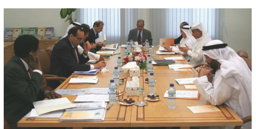
Meeting of Board of Directors in June

Administration plays a critical role in supporting the scientific endeavor of the Center. An