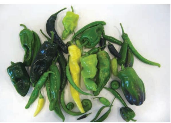
Variation in fruit size, color and shape of pepper

Morpho-agronomic characterization was undertaken on 95 tomato, 92 pepper and 20 okra germplasm