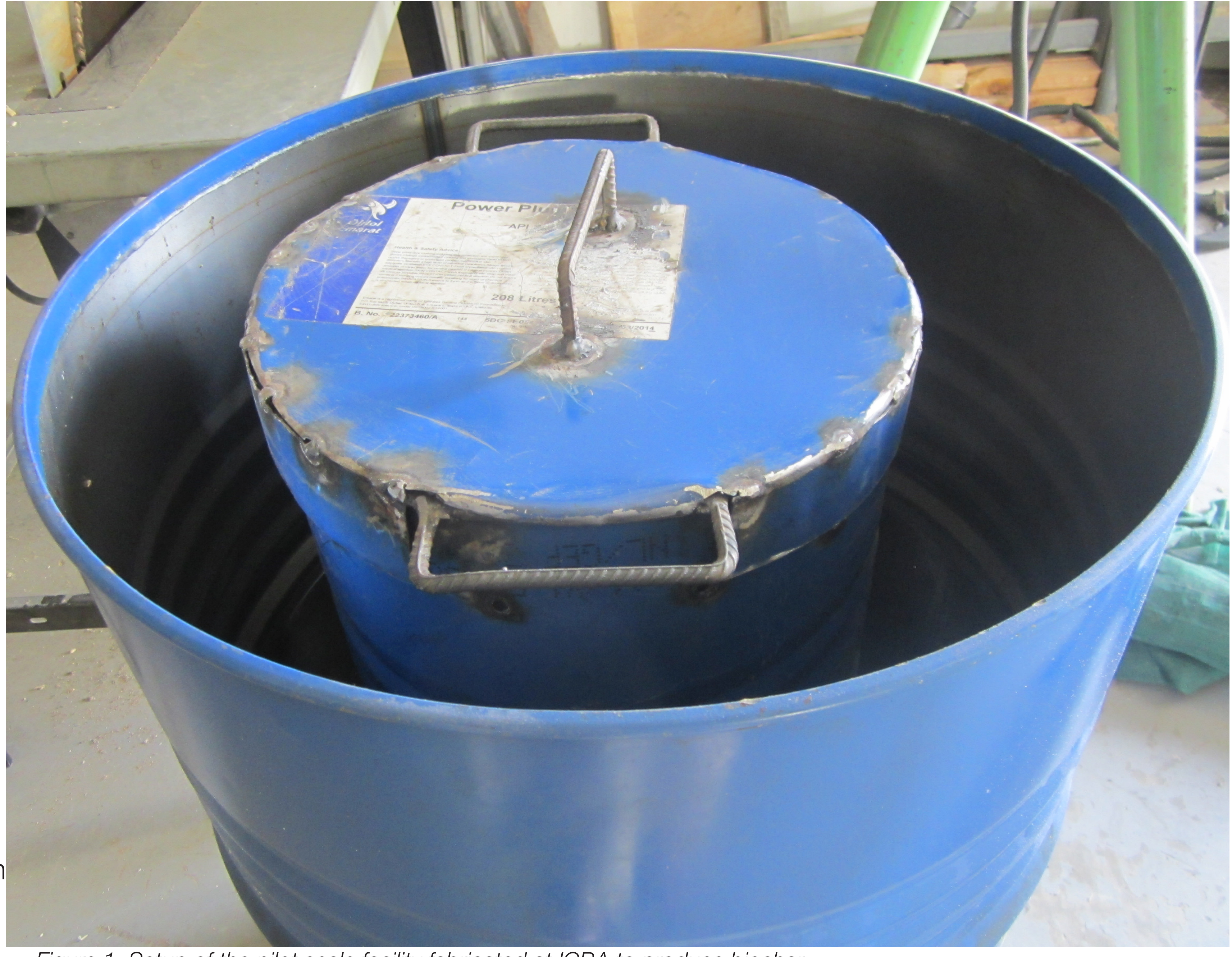
Figure 1: Setup of the pilot scale facility fabricated at ICBA to produce biochar

Considering the importance of date palm production in the UAE and to handle the date palm green waste in a sustainable and eco-friendly way, an innovative on-farm biochar production technology has been developed. This low-cost farmer-friendly and affordable technology is ready to be deployed on a large scale not only to improve marginal soils but also to help farmers get better and more yields on a sustainable basis.